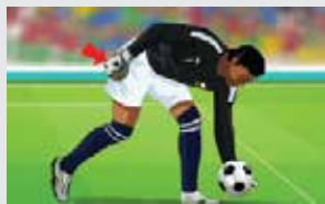
Vocabulary: English Clothes: _____