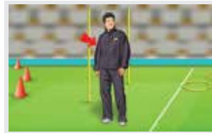
Vocabulary: English Clothes: _____

Write the English words under the pictures.