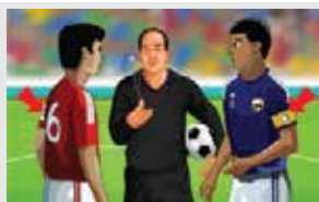
Vocabulary: English Clothes: _____