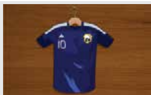
Vocabulary: English Clothes: _____