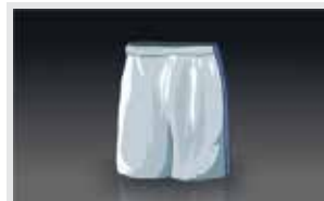
Vocabulary: English Clothes: _____