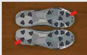
Vocabulary: English Clothes: _____