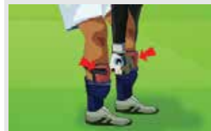
Vocabulary: English Clothes: _____