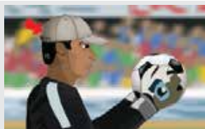
Vocabulary: English Clothes: _____