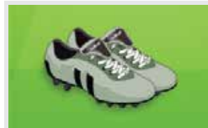
Vocabulary: English Clothes: _____